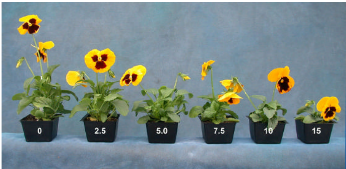
Figure 3. Plant growth response of 'Majestic Giant Yellow Blotch' pansies to flurprimidol foliar sprays.

Because of the high efficacy of flurprimidol on pansies, grower recommended concentrations would be between 2.5 and 7.5 mg·L -1 for vigorous pansy cultivars such as 'Majestic Giant Yellow Blotch' (Fig. 3). Cultivars vary in their response to plant growth regulators, therefore growers will need to conduct their own trials to determine optimal concentrations for their operation and cultivars used.