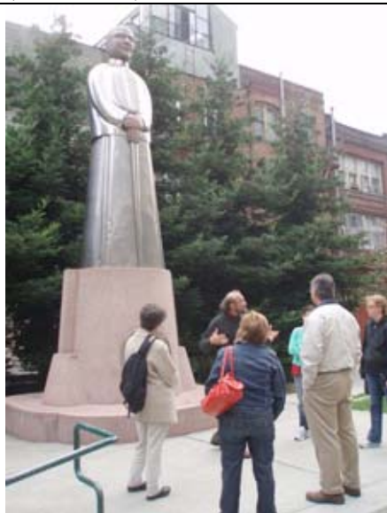
Touring San Francisco during a free evening at the conference.