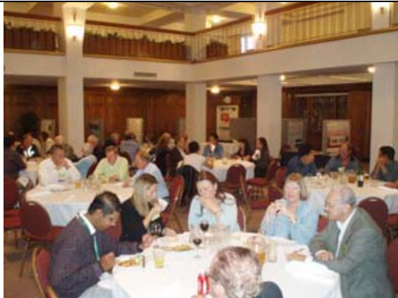
Poster Session attendees enjoying good company.