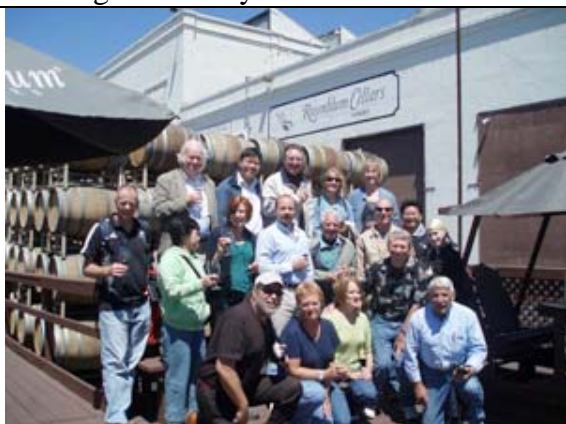
The post-conference tour attendees on their final stop at Rosenblum Cellars.