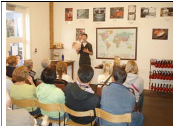
Learning about the history of cacao.