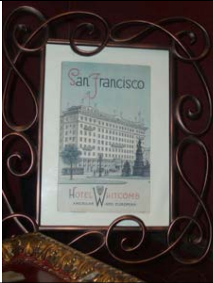
The historic Hotel Whitcomb was the site of the 2008 annual meeting in San Francisco.