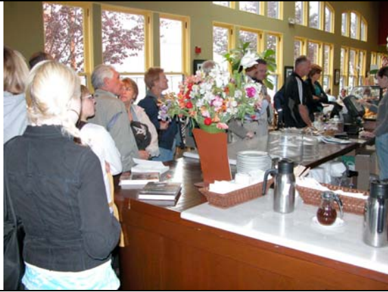
Conference attendees Scharffen Berger's café.