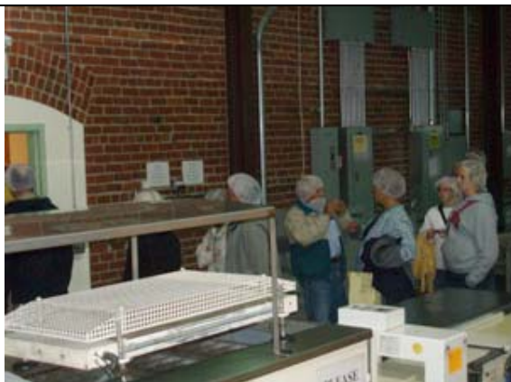
Touring the factory.