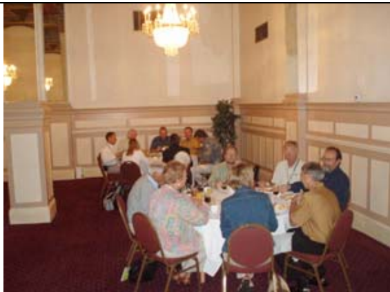
Sustaining Member Breakfast attendees.