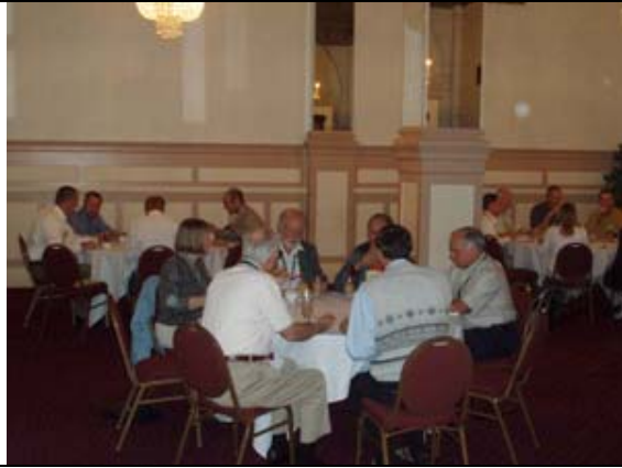
Sustaining member breakfast attendees.