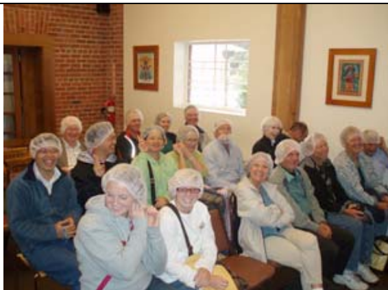
Donning hairnets prior to the factory tour! Didn't we do this in Halifax too?