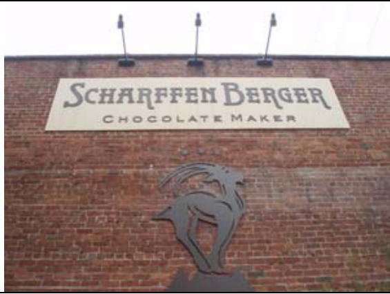
Post conference tour to Scharffen Berger Chocolates in Berkeley.