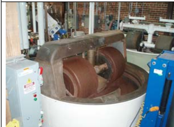
Cacao beans during the crushing process.