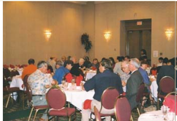
The business luncheon.