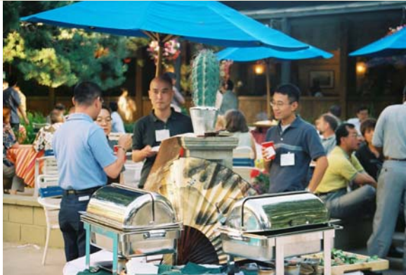
Attendees at the opening reception enjoy good food and good weather.