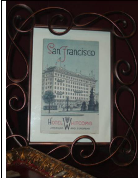
The historic Hotel Whitcomb was the site of the 2008 annual meeting in San Francisco.