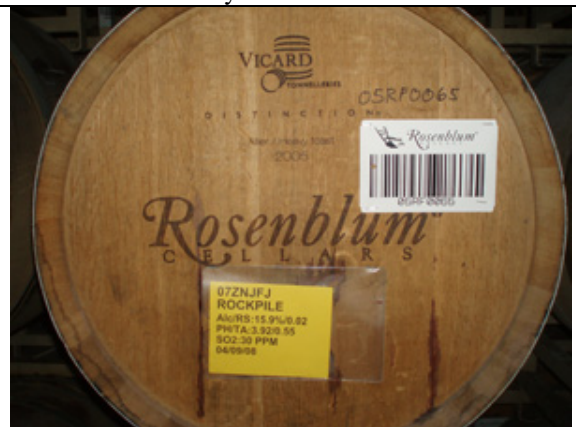
At Rosenblum Cellars.