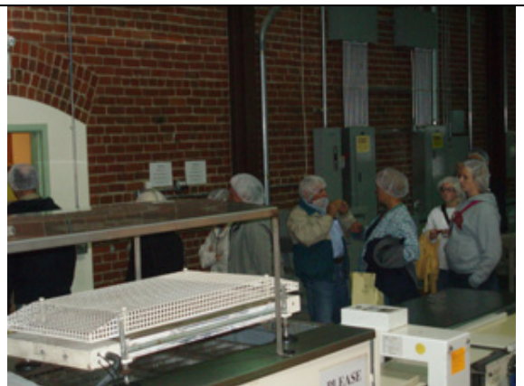
Touring the factory.