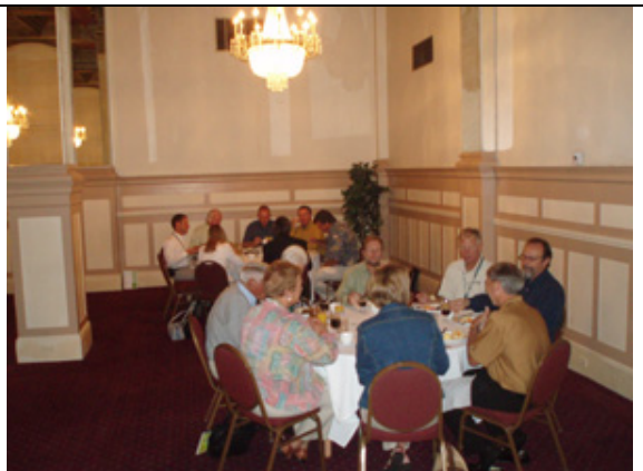
Sustaining Member Breakfast attendees.