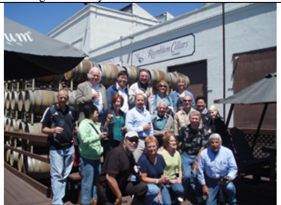
The post-conference tour attendees on their final stop at Rosenblum Cellars.