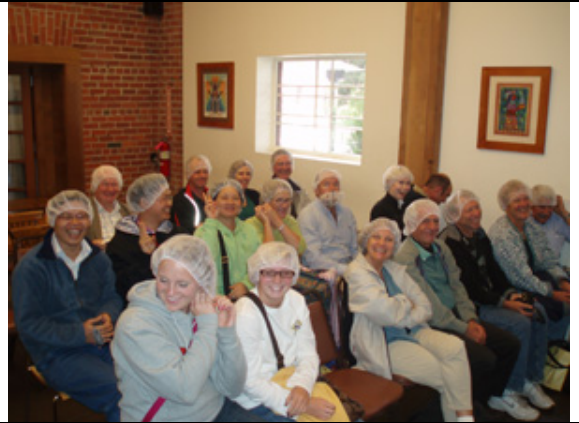
Donning hairnets prior to the factory tour! Didn't we do this in Halifax too?