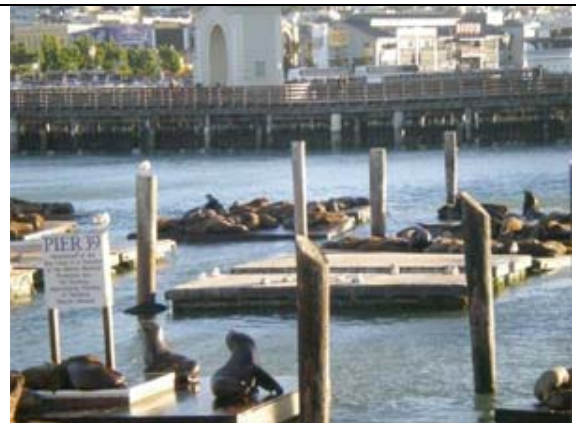
We'll see you next year in the Blue Ridge Mountains in Asheville, North Carolina!