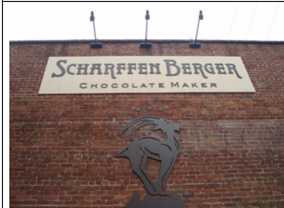
Post conference tour to Scharffen Berger Chocolates in Berkeley.