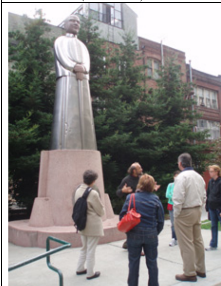
Touring San Francisco during a free evening.