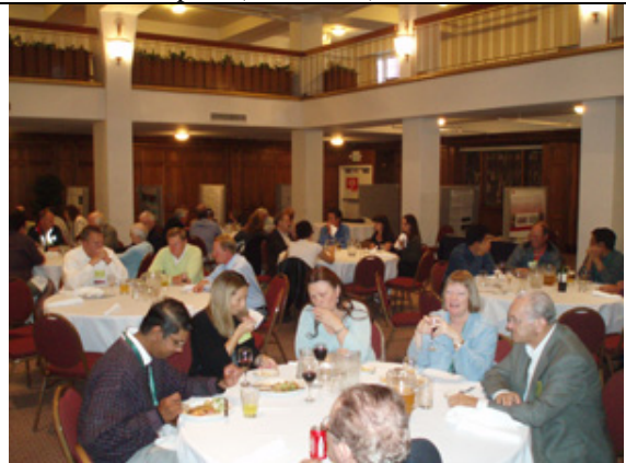
Poster Session attendees enjoying good company.