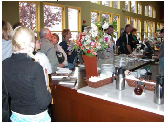
Conference attendees Scharffen Berger's café.