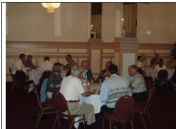
Sustaining member breakfast attendees.