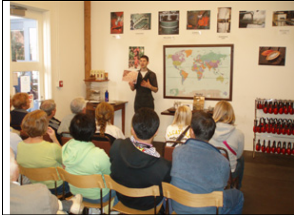
Learning about the history of cacao.