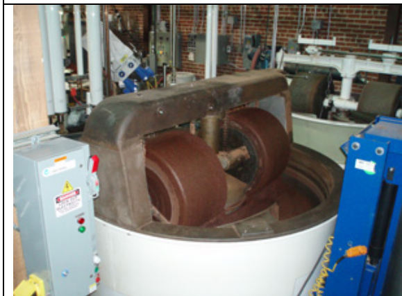
Cacao beans during the crushing process.